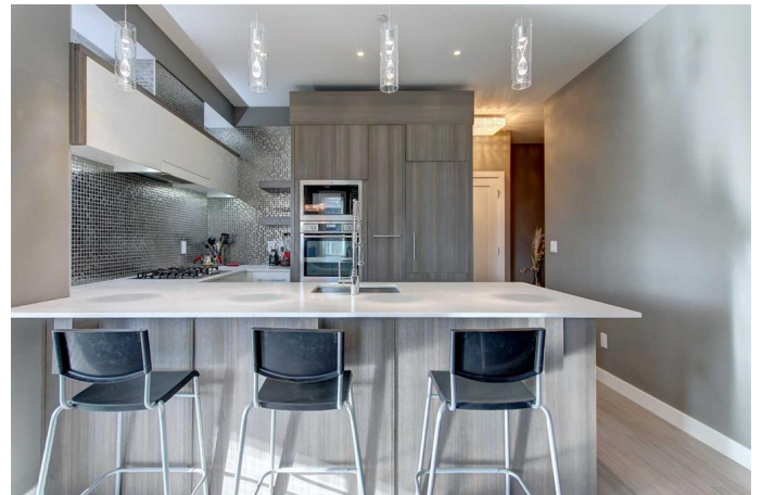
308-119 19 St NW, Calgary, AB

Welcome to Savoy by Truman Homes, where urban convenience meets contemporary style! Nestled in the heart of Kensington West, this vibrant community offers an incredible lifestyle—step outside to explore charming boutique shops, restaurants, bistros, and delis. Enjoy easy access to transit, the Bow River pathways, Kensington Village, and downtown, plus a well-established neighborhood with schools, parks, playgrounds, and more! This bright and unique corner unit boasts south east-facing exposures, flooding your space with natural light. Step into a welcoming entryway with a closet, leading you to a sleek, modern kitchen featuring high-end appliances, quartz countertops, and custom cabinets. The open layout flows effortlessly into the dining and living areas, the perfect spot to relax, with access to the south-facing balcony. The spacious primary bedroom features a luxury ensuite pampering you with a deep soaker tub, a large standing shower, and a stunning Kohler glass vessel sink. The flexible second bedroom is thoughtfully placed on the other side of the unit for added privacy. The spa-inspired main bathroom includes a huge walk-in shower and stylish glass vessel sink. Plus, the in-suite laundry offers additional storage and organization. Enjoy the added perks of a rooftop patio, secure titled underground parking, a separate storage locker, and bicycle storage. This stunning home is move-in ready—come experience the best of Kensington living today!