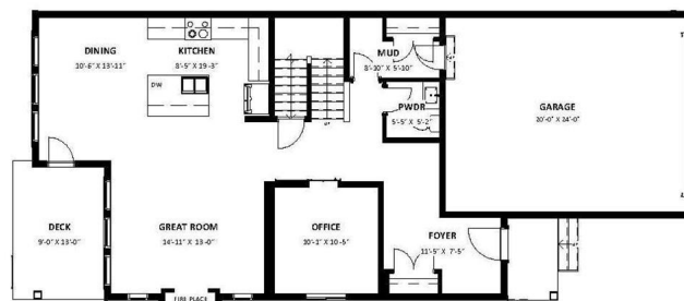
MAIN 1,085 SQ.FT. GARAGE 477 SQ. FT.